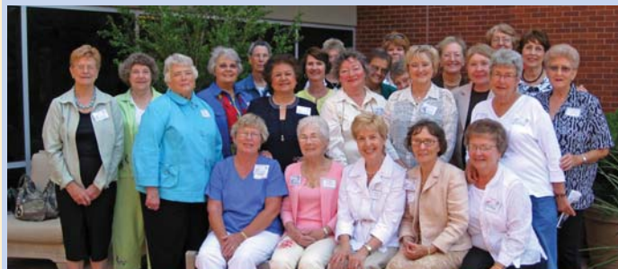
Members of the Class of '58.

St. Anthony Foundation had the honor of hosting the 2008 St. Anthony School of Nursing Alumnae brunch on June 14th. Several members of the graduating class of '58 attended the brunch to celebrate their 50th anniversary.