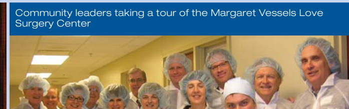
Community leaders taking a tour of the Margaret Vessels Love Surgery Center