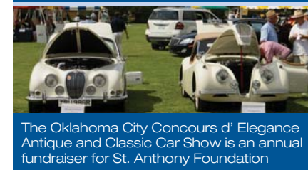
The Oklahoma City Concours d' Elegance Antique and Classic Car Show is an annual fundraiser for St. Anthony Foundation